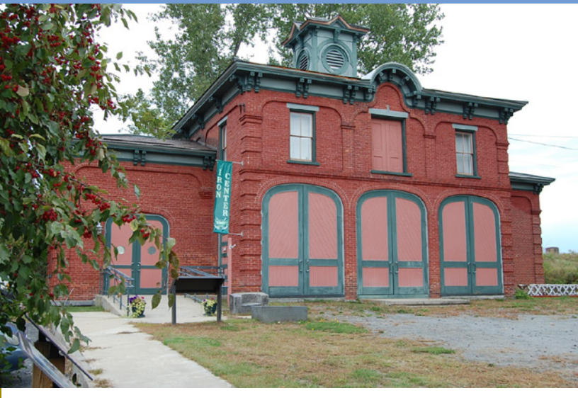
The Iron Center/ROOST-Lake Champlain Region

Motorists and bicyclists share scenic roads. Use caution on narrow, winding or unpaved roadway. Follow traffic laws and ride safely. Bicycles are vehicles by law and have the right to use public roads. You are responsible for operating your bicycle under all conditions.