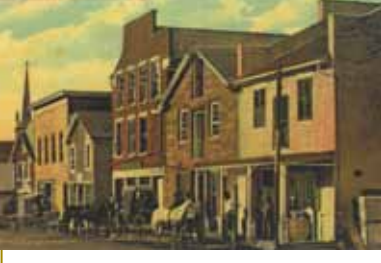
Gray's Atlas of Essex County, published in 1876, details these shops, lost to fire in August of that year, because the information had already gone to press.

Take a few minutes to enjoy the captivating view of Lake Champlain and the formal garden, beautifully restored by the Trustees of Ballard Park<sup>2</sup> (2002). The Westport Inn commanded this same view of the Green Mountains, anchored by Camel's Hump to the north. Many wealthy guests of the Inn loved the view so much that they, or their descendants, built private summer homes along the lake shore.