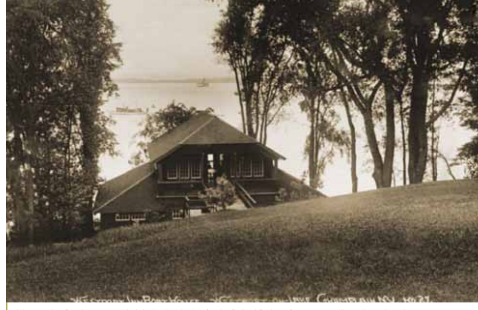
Westport Inn Boathouse provided design inspiration for the Ballard Park performance pavilion, pictured on the cover of this tour brochure.

South along Main Street, cottages associated with the Westport Inn still recall the bye-gone grace of that era: Garden Cottage <sup>40</sup>, just beyond the restored gardens, at the corner of Old Arsenal Road and, behind it, Knolls Cottage <sup>41</sup>, The Gables<sup>42</sup>, next to Heritage House and, at the corner of Liberty Street, the Corner Cottage<sup>43</sup> also known as the Music Room after the music wing of the Inn was moved to the rear of the Golf Links Club House. A carriage shop run by J. N Barton occupied this corner in the mid 1800s. The front half of the building served as the Club House for the Golf Links