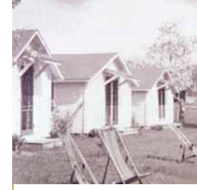
Farmers welcomed the cash income they could make from summer visitors by renting out rooms or building vacation cabins. Walker Farm Cabins were located north of Sisco Street near the present NYS boat launch.

Out where the sidewalk ends, "Mt Pleasant"<sup>49</sup> (1870-1890) served as an inn for summer visitors from its beginning. Over the years, innkeepers Lowe and Anna Fuller added more rooms and a dining area. Around 1900, they built an annex with thirty additional rooms at the rear of the property. Across the road, sited well below street level, stands "Windward"<sup>50</sup> (1906), which served a series of owners as a grand summer home. A seasoned inn-keeper, W J Dyke bought it (1949) and opened an inn, converting the stables and boathouse to guest cottages. Present owners purchased the adjacent property, Westport Vacation Land, removed the motel but retained the lake-shore cottages.