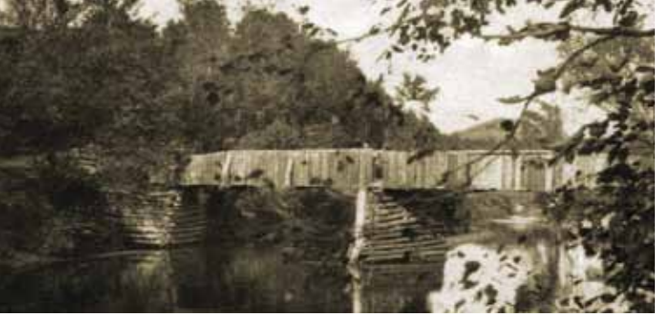
The dam broke in the spring of 1866, sending the contents of the mill pond over the falls and washing away the bridge at the foot of Church Street. At the time, a plank bridge connected the hamlet with the grist mill. Afterwards, that bridge was extended to the far shore, and this first crossing abandoned.

The Congregational Church <sup>76</sup> (1837) demonstrates the architecture of frugality practiced by people who knew the value of a well-constructed building. It took ten years for the First Congregational and Presbyterian Society of Westport to complete this meeting house. Forty years after they moved it here, they salvaged the rear wing of the old hotel for a Parish Hall. The old stage and sprung dance floor still survive.