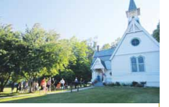
The historic Baptist Church, built after fire destroyed the first church, now the Westport Heritage House, serves as a visitor information center along the Lakes to Locks Passage Scenic Byway.

This tour will guide you through the evolution of Westport from its early industrial and agricultural beginnings to a summer resort that has responded to dramatic changes in expectations for rest and recreation over the course of a century and a half.