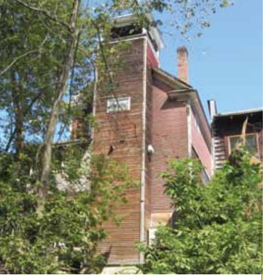
Firemen hung wet hoses in the tower of the "Old Hose House" to dry them after a fire. The bell that hung in an adjacent belfry was moved to the new fire station (1960) on Champlain Avenue.