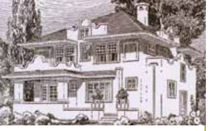
Sears draftsmen added a "Spanish flavor" to the classic American Four-square form and called it "Alhambra" for its California Mission style details. From the Sears Building Materials Catalog, 1924.