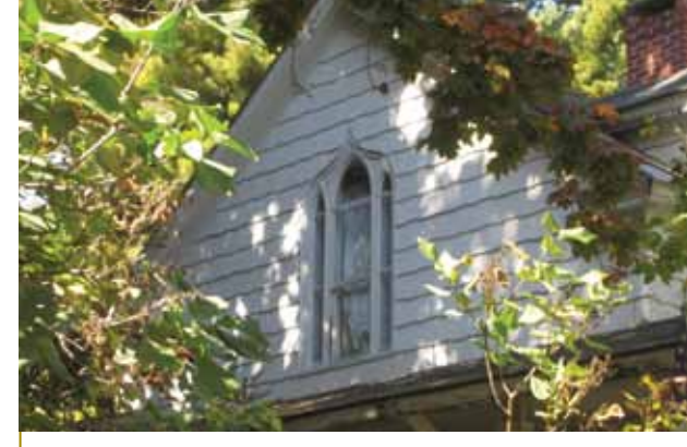
Perhaps the local carpenters created this remarkable Gothic Revival gable window because they were building the house for the Baptist preacher.

Turn right onto Front Street and then right again onto Orchard Terrace.