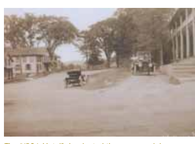
The "1831 Hotel" dominated the commercial center of Wadhams for nearly a century and a half. Inside, the Post Office, a harness shop and a store shared space with the hotel lobby. Famsworth Hall, the second-floor dance hall, hosted formal holiday gatherings.

he Boquet River falls forty feet over this granite cliff. The drop in elevation attracted the first settlers, who harnessed the waterpower to run their mills. The energy of falling water could power machinery. It could also tear a building off its foundations. Early mills did not last very long, but that did not deter men intent on harvesting the surrounding forests and making iron from nearby mines. As often happened in this region, the place changed names with the dominant millwright. Hence, "Coats Mills" became "Braman's Mills' before settling on "Wadhams Mills."