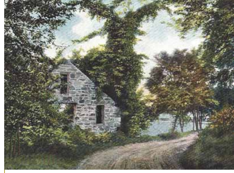
The stone grist mill rose three stories up from its wharf at lake level. The shoreline section of Washington Street, formerly Mill Street, follows the course of James Allen's delivery canal.

At this point, you can choose to turn left to follow the North Loop along Champlain Avenue, and up to the Fairgrounds and Depot (2.5 miles) or go right (and turn to page 14) to follow the South Loop down Main Street (and back) and around Orchard Terrace (2.3 miles).