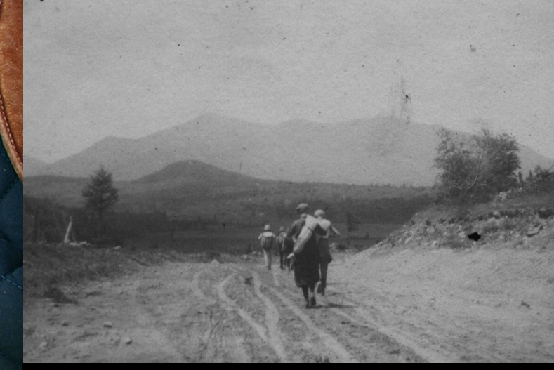
Campers, circa 1912, on their way to climb Whiteface mountain (background).

Each camper has the chance to realize a goal and feel a sense of accomplishment, wheter it be showing off a talent at a Moonshiner event, hitting a bullseye in archery, hiking a high peak, winning a ribbon in a horse show, or becoming an Admiral in sailing. Whatever it may be, every day at <u>Pok-O-MacCready</u> is filled with prospects of learning, growing, and gaining a better sense of self.