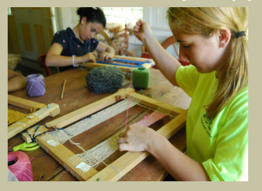
1812 HOMESTEAD CRAFT