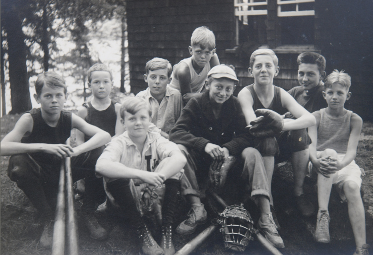
Throughout its century-old history, Pok-O-MacCready has always been a place to build lasting friendships.

<u>Pok-O-MacCready</u> is truly a second home and a second family - one that spans the country and the world. Since its inception, campers have come from a variety of nations including Venezuela, Germany, Spain, Italy, Egypt, Mexico, Israel, France, Singapore, and the United Kingdom.