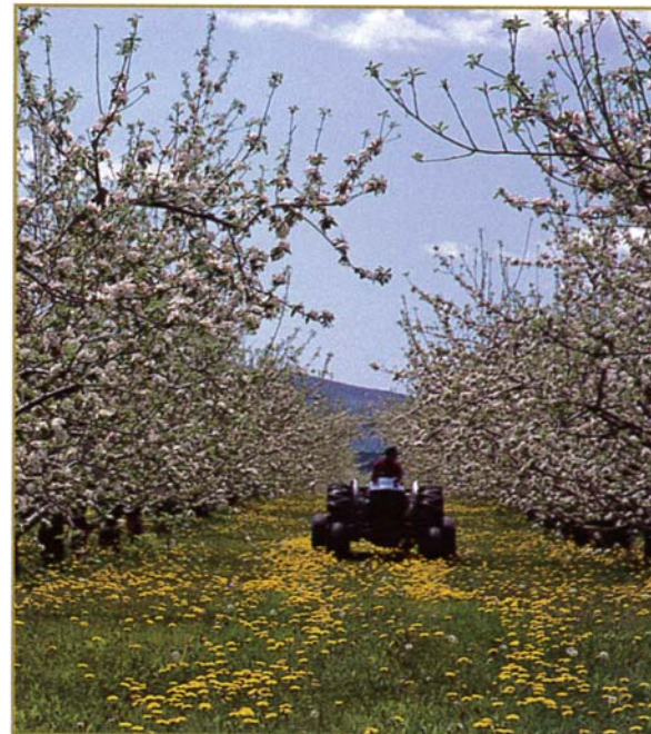
Apple blossoms in Peru

The orchards that mark the countryside of Peru had humble beginnings as backyard orchards in the late 1890s. The first commercial orchard, Northern Orchards which is on the route, began production in 1906. The larger orchards are in excess of 5,000 acres, and approximately 80% of the apple trees are of the McIntosh variety. These trees are ideally suited to the Champlain Valley due to their ability to withstand harsh winters, and to mature in a shorter growing season. In addition, this loop passes the largest dairy farm in Clinton County and offers a spectacular view of a river carved gorge at Ausable Chasm.