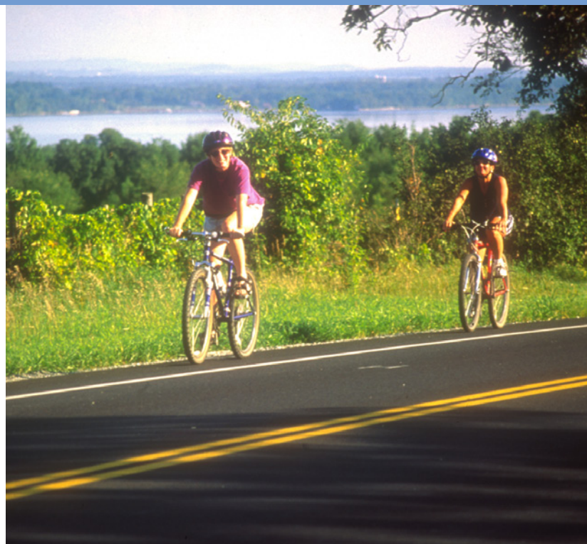
Cyclists touring the Champlain Bikeway

Motorists and bicyclists share scenic roads. Use caution on narrow, winding or unpaved roadway. Follow traffic laws and ride safely. Bicycles are vehicles by law and have the right to use public roads. You are responsible for operating your bicycle under all conditions.