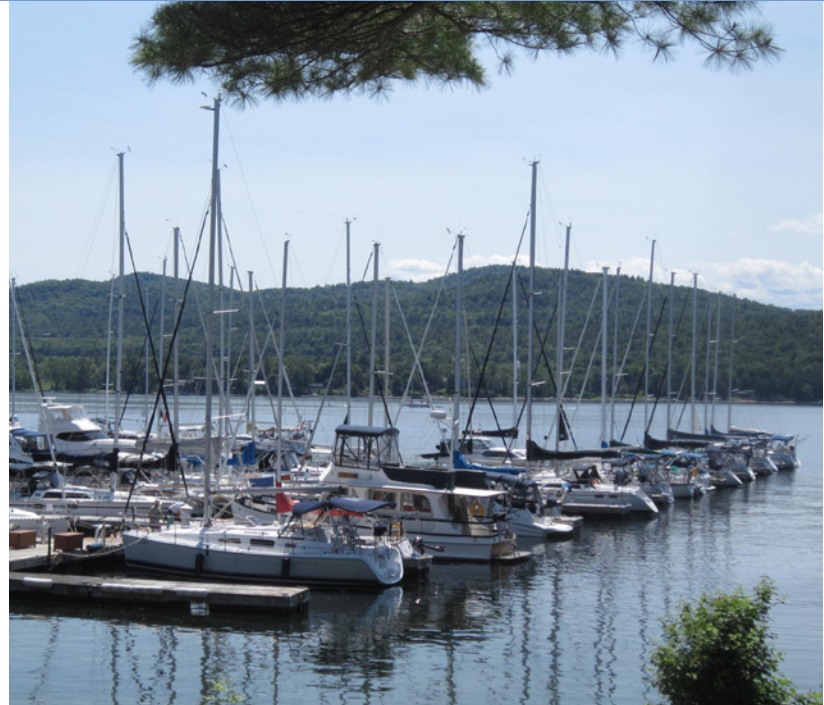
ROOST-Lake Champlain Region

Motorists and bicyclists share scenic roads. Use caution on narrow, winding or unpaved roadway. Follow traffic laws and ride safely. Bicycles are vehicles by law and have the right to use public roads. You are responsible for operating your bicycle under all conditions.